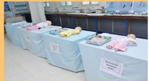
CHILD HEALTH NURSING LAB