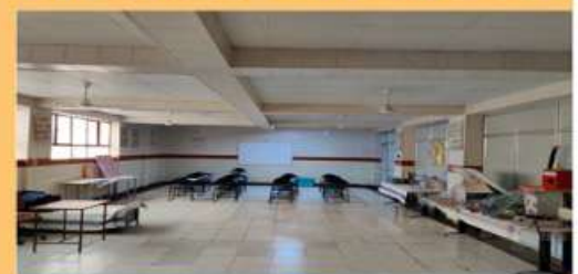
COMMUNITY HEALTH NURSING LAB