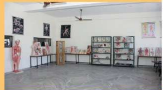
PRE-CLINIC SCIENCE LAB