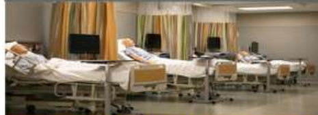
ADVANCE NURSING SKILL LAB