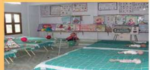
OBG AND PEDIATRIC LAB